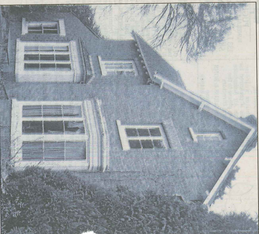
Hilda's home, in Sutton Road, from where she was abducted